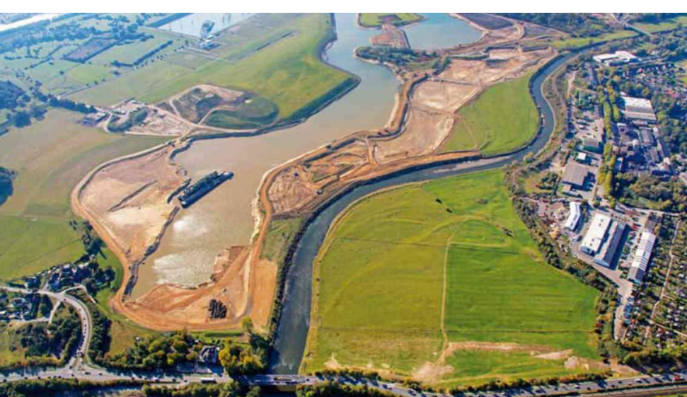
The old estuary of the Lippe River 2009 1