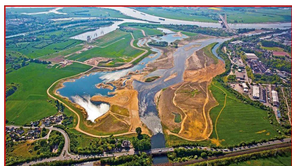
The new estuary of the Lippe River 2014 1