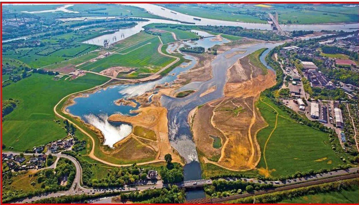
The estuary 2