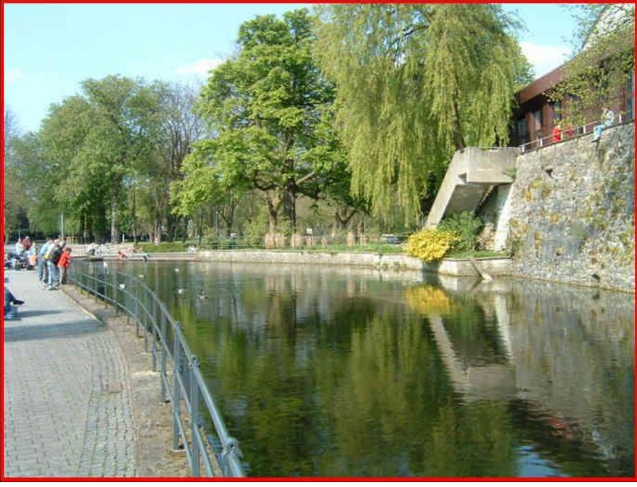
The spring 1